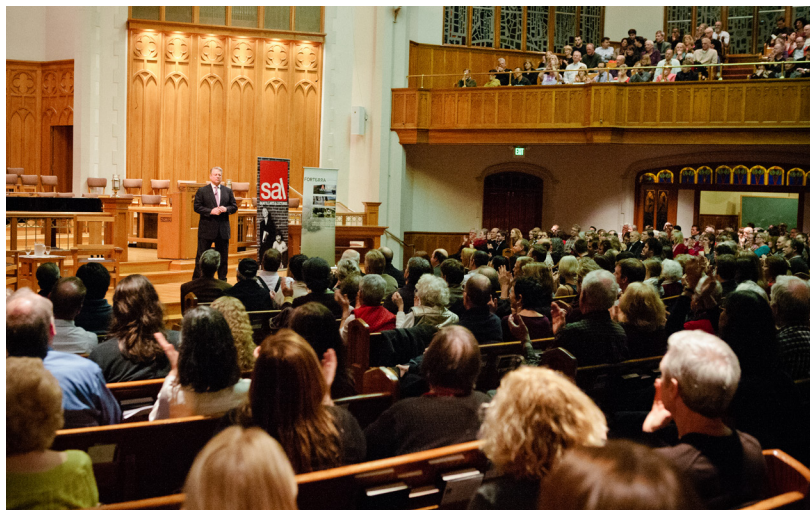
▲ Al Gore captivates a sold-out crowd at our February 14, 2013 event.

We're proud to share this snapshot of our work last year, and we look forward to an even more inspiring year to come!