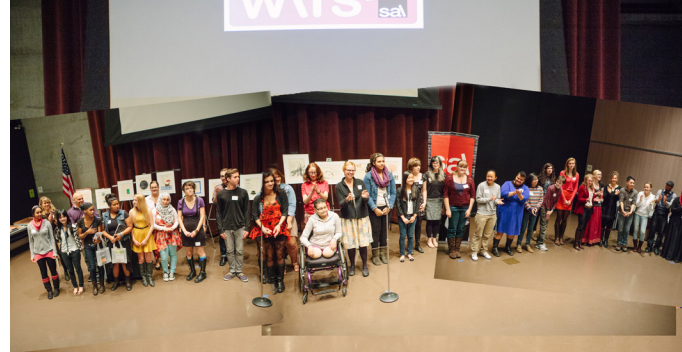
▲ All of the elementary and middle school readers and their writers-in-residence at the year-end WITS reading and celebration on May 22, 2013.